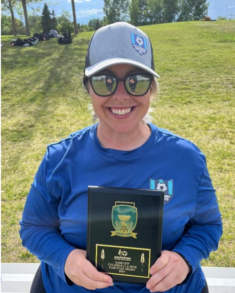
Fair Play: Battlefords United