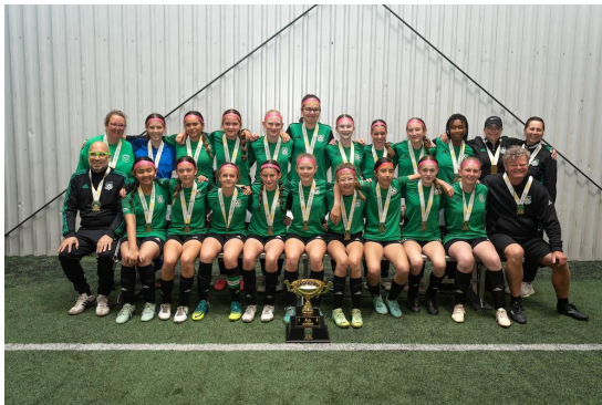
Gold Medal: Aurora Eclipse (photo) Silver Medal: Aurora Concordes

Competing Teams: Aurora Concordes, Aurora Eclipse, Battlefords United, FCR Pink Elites, Hollandia Gorges