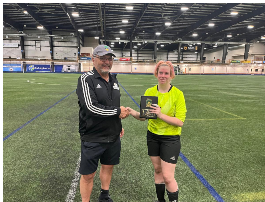
Fair Play: Lakewood Leones