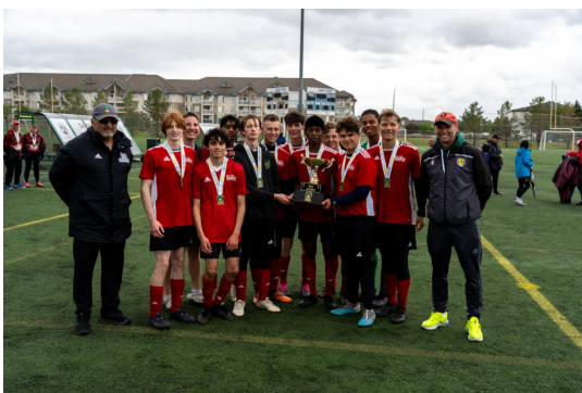
Gold Medal: SUSC Swansea (photo) Silver Medal: Hollandia Humm

Competing Teams: Battlefords United, Hollandia Humm, SUSC Swansea