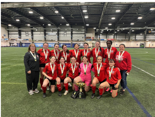
Gold Medal: Yorkton United FC (photo) Silver Medal: Lakewood Leones

Competing Teams: Lakewood Leones, Yorkton United FC