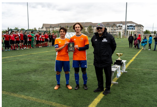
Fair Play: Hollandia Humm