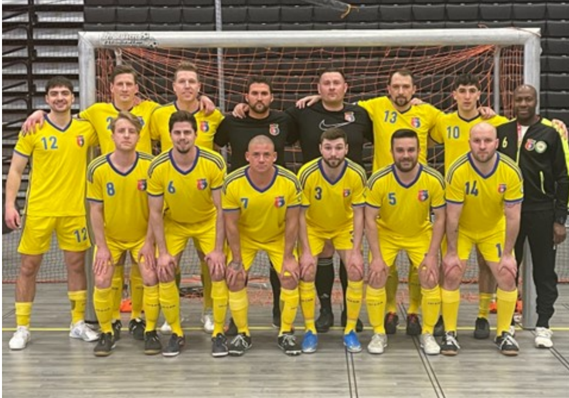
Olimpia SK FC