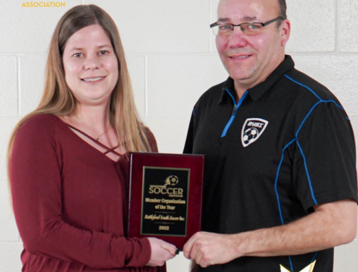
Battleford Youth Soccer Inc. Member Organization of the Year