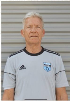
Mark Lord Coaching Dedication Award